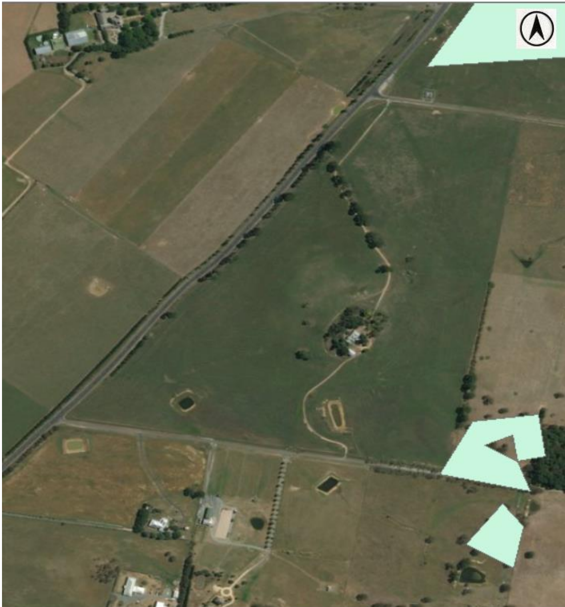
Figure 2: Vegetation mapping at "Allfarthing" 2 Brisbane Grove Road, Brisbane Grove NSW