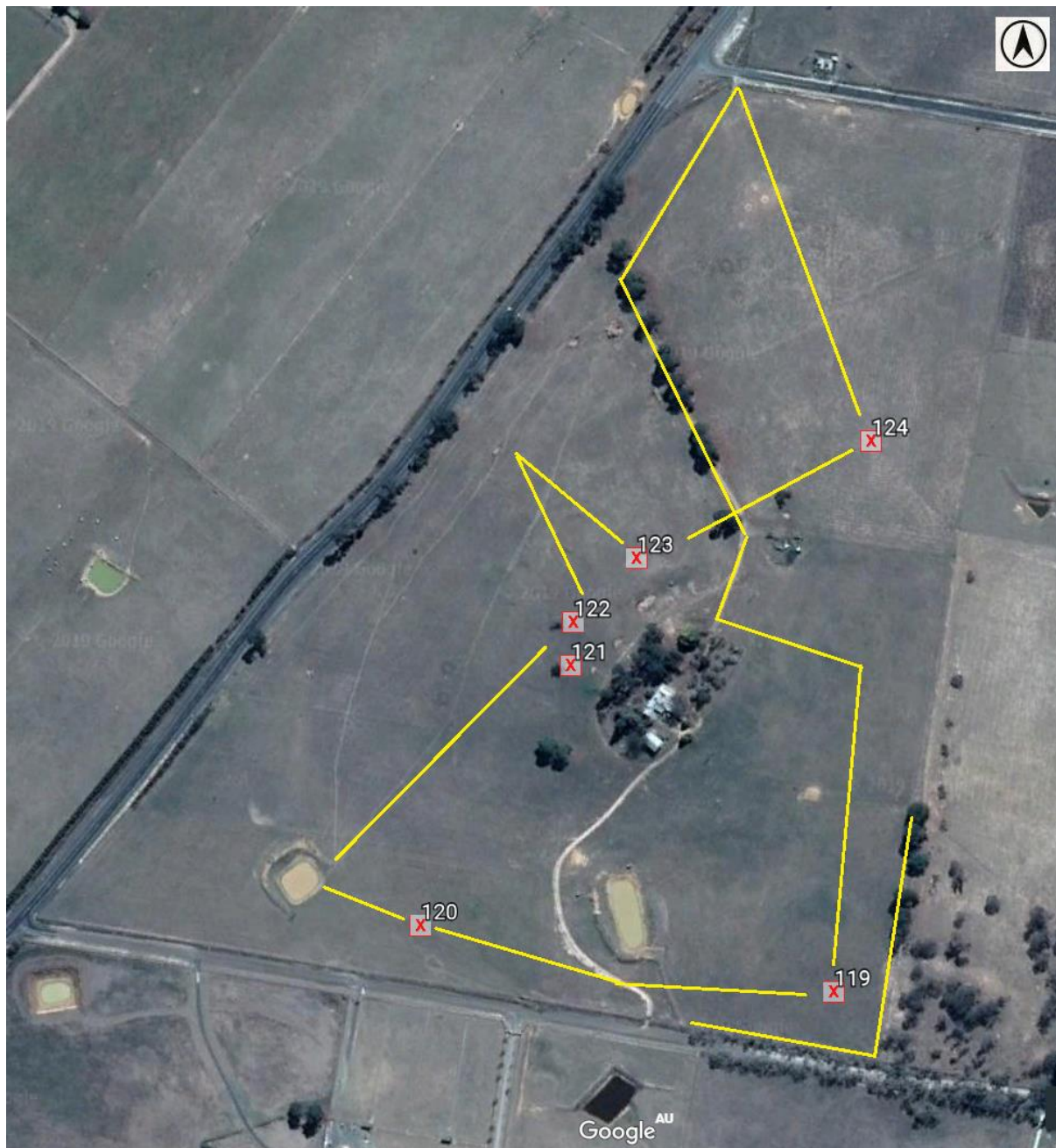
Figure 3: Survey sites and waypoints at "Allfarthing" 2 Brisbane Grove Road, Brisbane Grove NSW